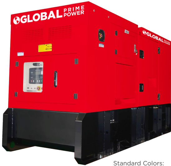
Standard Colors: Red or White

Global Prime Power generators are specifically designed to provide prime power or temporary power anywhere and anytime utility power is not available.