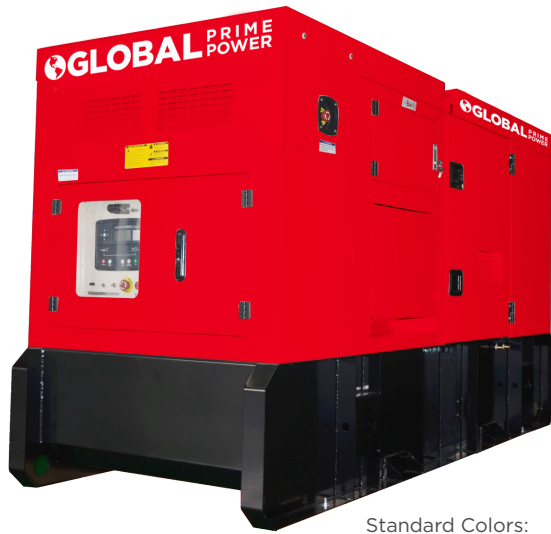
Standard Colors: Red or White

Global Prime Power generators are specifically designed to provide prime power or temporary power anywhere and anytime utility power is not available.