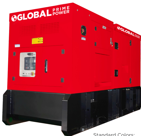
Standard Colors: Red or White

Global Prime Power generators are specifically designed to provide prime power or temporary power anywhere and anytime utility power is not available.